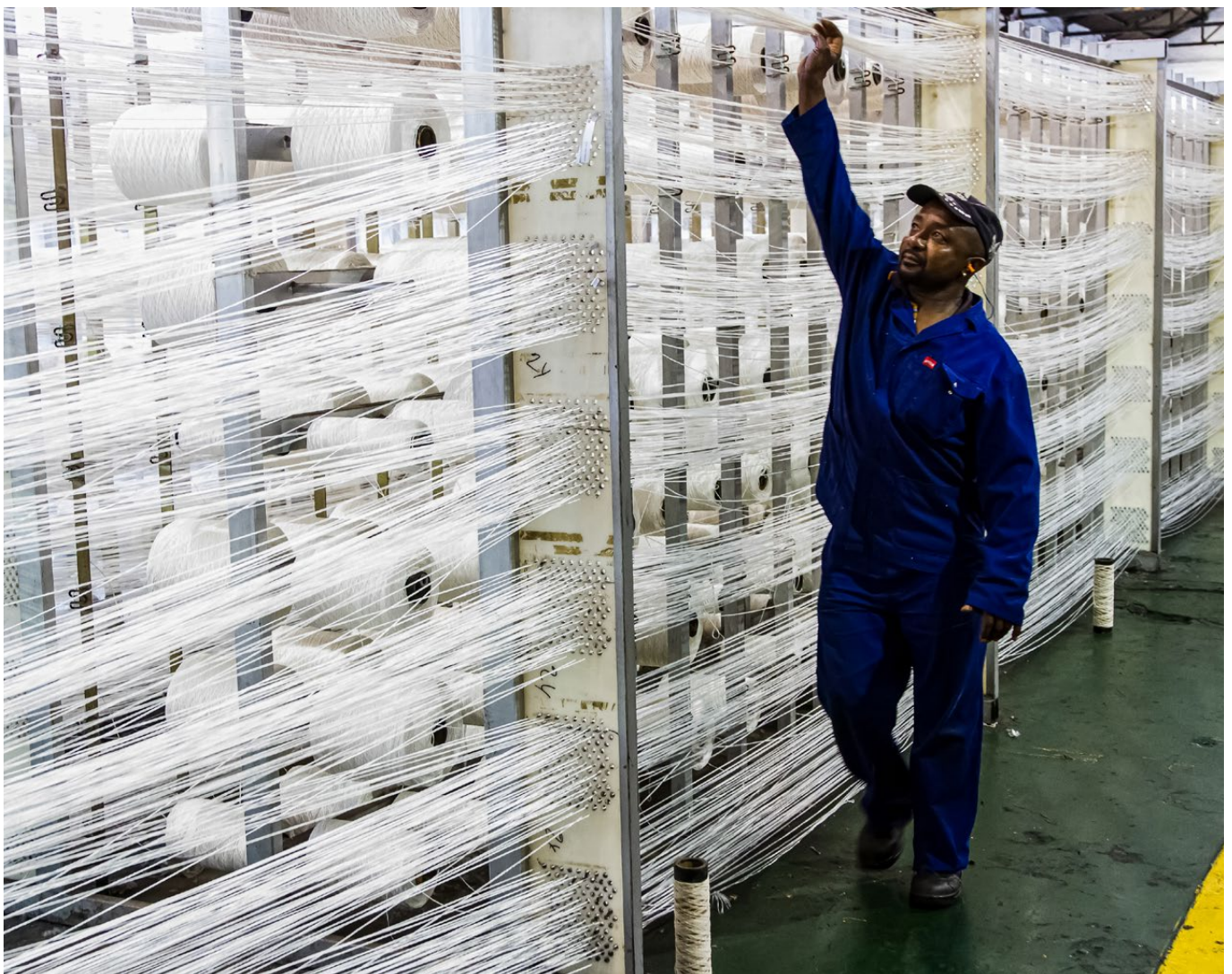
Worker checking cotton thread lines for a copwinder weft assembly line loom in Johannesburg, South Africa.

Companies stress that limited resources and leverage mean that they cannot do everything; they must make choices, prioritizing a few risks/impacts at