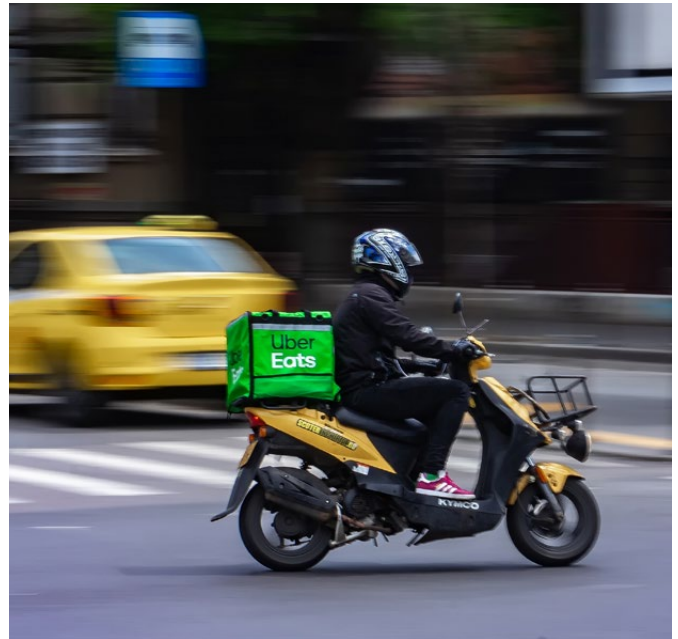
Uber Eats food delivery courier on a scooter in Bucharest, Romania.

The norms clearly frame due diligence as about preventing potential adverse impacts and mitigating and addressing actual adverse impacts. However, the expectations of prevention, mitigation and remediation do not exist on an equal footing. According to the UNGPs, HRDD is geared towards preventing (future) harms, while recognizing that existing impacts deserve remedy. The OECD Guidance on RBC defines the preventative nature of due diligence as one of its key characteristics and preventing impacts the primary purpose of due diligence. It states that the “purpose of due diligence is first and foremost to avoid causing or contributing to adverse impacts on people, the environment and society, and to seek to prevent adverse impacts directly linked to operations, products or services through business relationships. When involvement in adverse impacts cannot be avoided, due diligence should enable enterprises to mitigate them, prevent their recurrence and, where relevant, remediate them.”