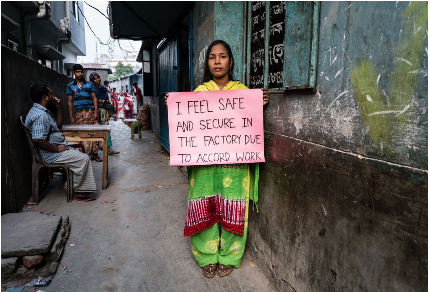
The Bangladesh Accord is a best practice example in the context of due diligence.

the action of disengaging. 63 It is important to note that in order to disengage responsibly, the disengaging company must contribute to the remediation of all previous adverse impacts to which it contributed, even if the company disengages from the business relationship through which it contributed to the impact. Disengagement does not absolve a company from its remediation responsibilities.