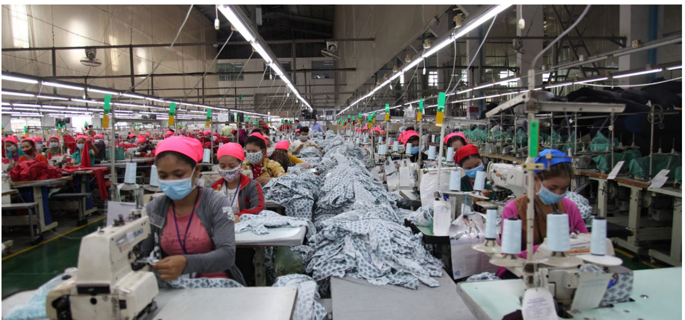
Garment workers in a factory in Cambodia during Covid-19 crisis.

Providing additional detail and clarification of certain concepts will be necessary to ensure that the legislative turn of the international norms realizes their full potential for having a positive impact on company practice and subsequently the situation on the ground for workers and communities. Thus, when translating the soft-law expectations into hard-law obligations for companies, it is important to preserve the original intent and spirit of these standards, keeping in mind that the ultimate objective is to achieve better outcomes for people in terms of increased respect for human rights and greater access to justice and remedy.