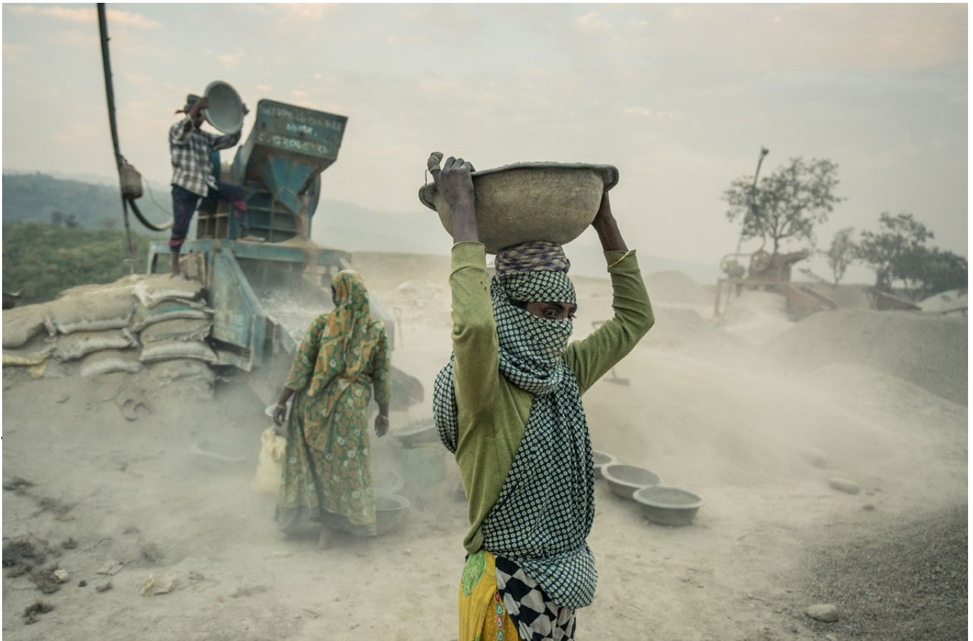
Hard working women in the stone industry in Jaflong, Bangladesh.

nies should seek to address all their risks and impacts simultaneously, and only in exceptional cases, i.e., where this is not justifiably “possible” or “feasible,” they may prioritize certain risks and impacts for immediate action. The onus is on companies to explain why it may not be feasible or possible in certain circumstances to address all risks and impacts at once, and claiming to have “limited resources” is not a valid excuse (see section 2.4 below).