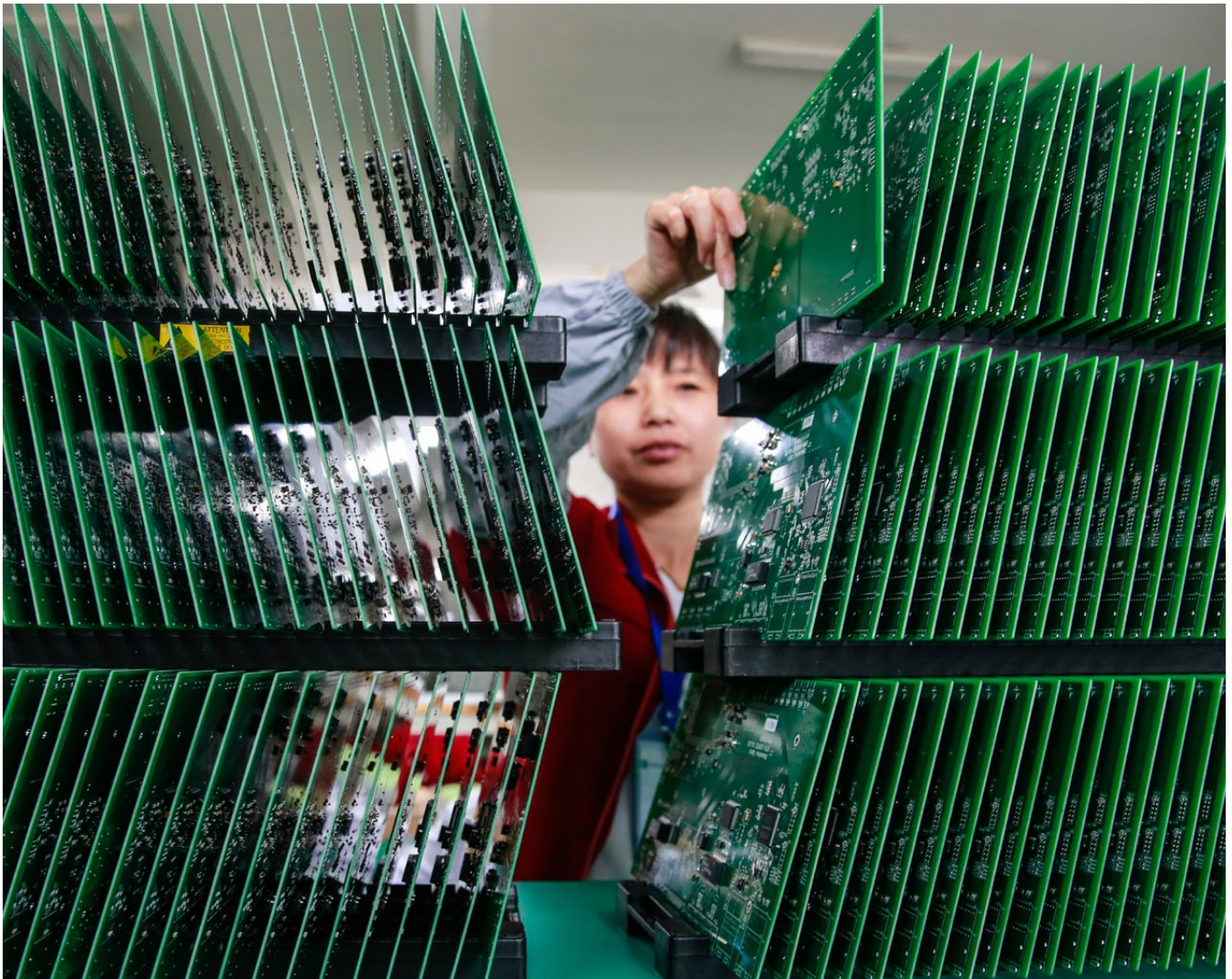
Factory worker piling circuit boards in Jiangxi, China.

A challenging aspect of the duty to communicate HRDD lies in its relation to companies' confidentiality commit-