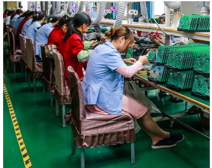
Workers putting chips on the circuit board in a factory in Jiangxi, China.

Companies are expected to address all human rights impacts and risks, but if it is genuinely not possible for them to address all impacts and risks immediately or simultaneously, they can prioritize and sequence their actions. When companies do prioritize, this should be based on the severity of the impact and the likelihood of it occurring. In some cases, a company may be connected to an impact by virtue of its business model or due to systemic risks, or the company may have limited resources to address the impacts in question.