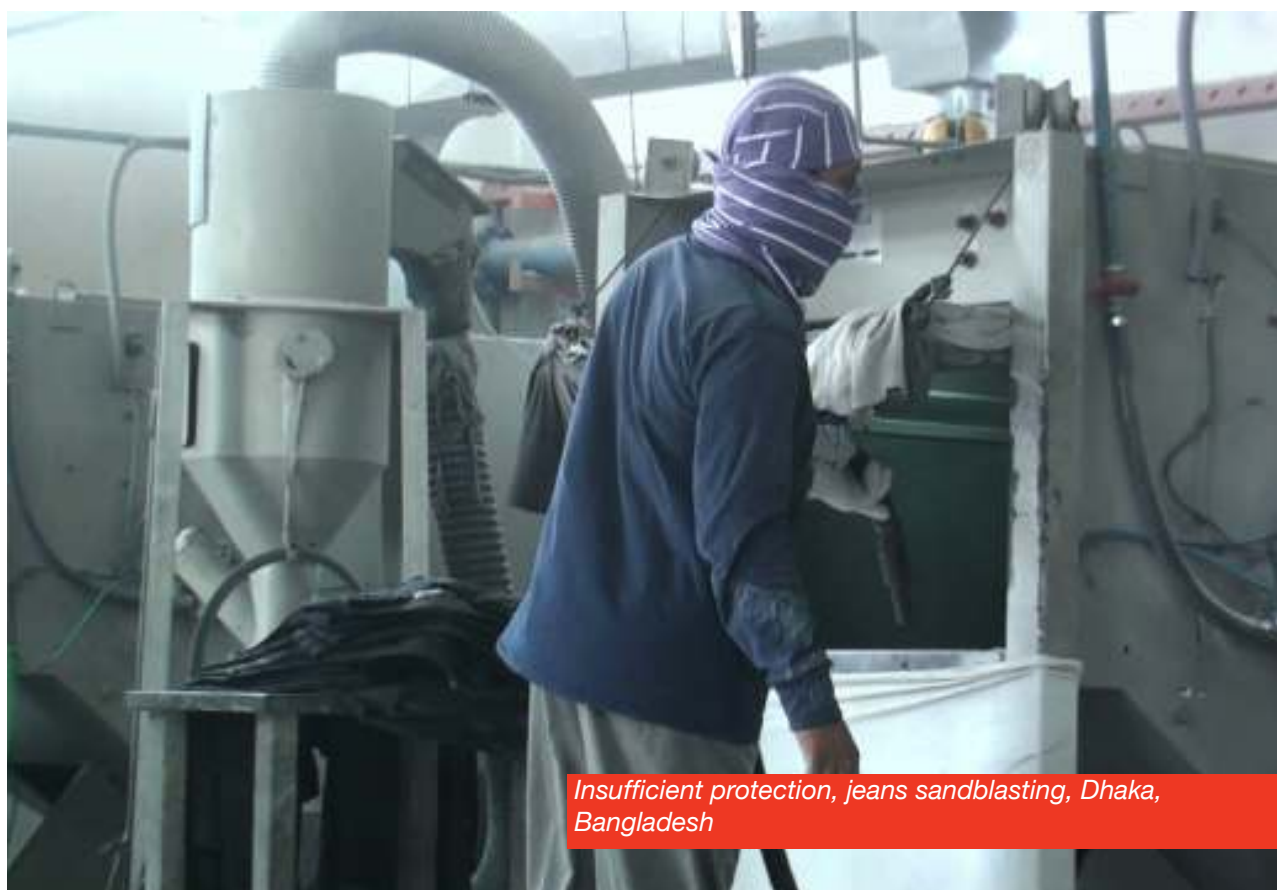
Insufficient protection, jeans sandblasting, Dhaka, Bangladesh

CCC has also called on consumers to stop buying sandblasted jeans. We call on governments of jeans-producing countries to outlaw denim sandblasting, to ensure that occupational health and safety rules are enforced, and to provide disability pensions to sandblasters who have contracted silicosis. A number of fashion companies and retailers have already banned the sale of such jeans, or publicly announced that they would phase it out over the next months. Amongst them are Levi-Strauss & Co., Hennes & Mauritz (H&M) and C&A. The campaign will continue in 2011.