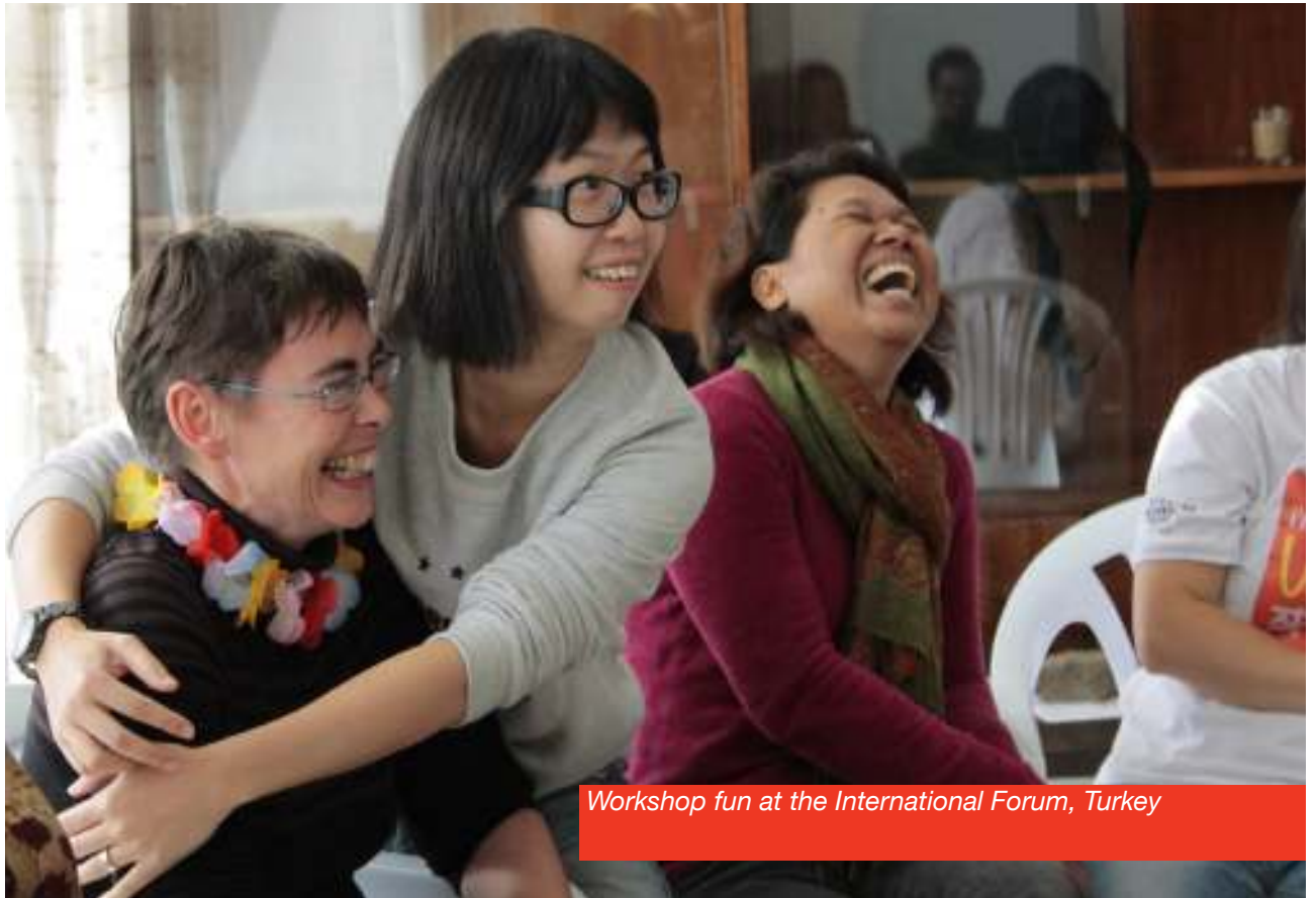
Workshop fun at the International Forum, Turkey