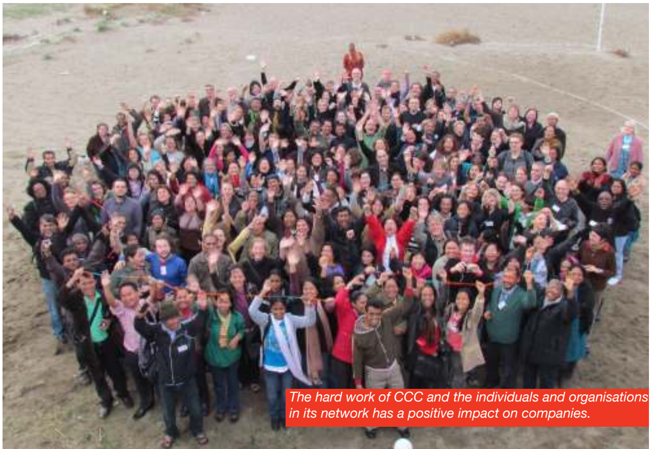
The hard work of CCC and the individuals and organisations in its network has a positive impact on companies.