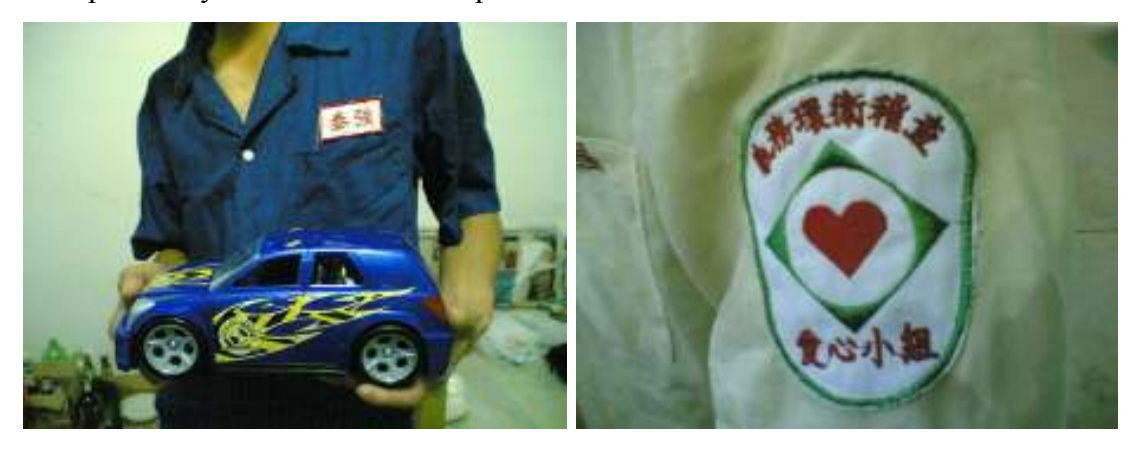
A Tai Qiang worker and core member of the "Compassion Group."

At Tai Qiang, workers with higher levels of rights consciousness have created their own "Compassion Group" [ Aixin Xiaozu ], which inspired their co-workers to continue further organizing initiatives. From late 2004 onwards, some 200 production workers participated spontaneously in various activities held by the "Compassion Group Activity Centre" at the workplace level.